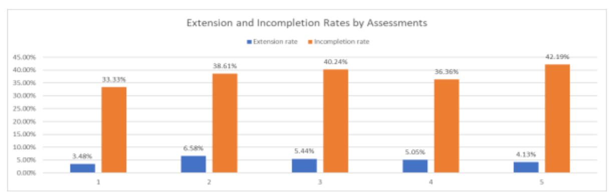
Figure 1: Extension and incompletion rates of assessments

The key to mitigating task aversion is to equip students with skills and knowledge necessary to complete each task, and to make the process of doing work enjoyable and rewarding for students. Procrastination on assignments may be reduced by providing step-by-step instructions, encouraging and timely feedback, and interesting topics (Ackerman and Gross, 2005). Breaking a big assignment into a series of smaller interdependent tasks may result in less procrastination (Stell, 1997), as students are less likely to put off a smaller, less effortful task compared to a big comprehensive assignment; successful completion of each smaller task will reinforce their confidence and desire to carry on with subsequent tasks. For part-time professional students, it is particularly important to associate assessment tasks with professional practice, so the students have opportunities to utilize and further develop their skills.